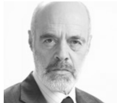
Doron Tavory - Baruch Milch

A sought-after actress, star of Israeli blockbuster "Zero Motivation" winner at the 2014 Tribeca Film Festival. A role that landed her in IndieWire's 20 best performances of 2014.