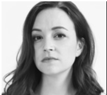
Nelly Tagar - Nana Milch-Kotler

A sought-after actress, star of Israeli blockbuster "Zero Motivation" winner at the 2014 Tribeca Film Festival. A role that landed her in IndieWire's 20 best performances of 2014.